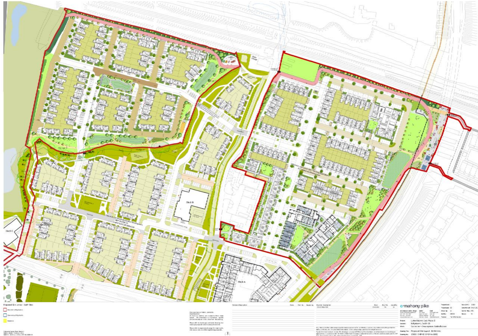
Figure 3-3 Proposed Development Site Layout (Left: Luttrellstown Gate Phase 2 Plot 1, Right: St Mochtas LRD Plot 2) (O'Mahony Pike, 2024)