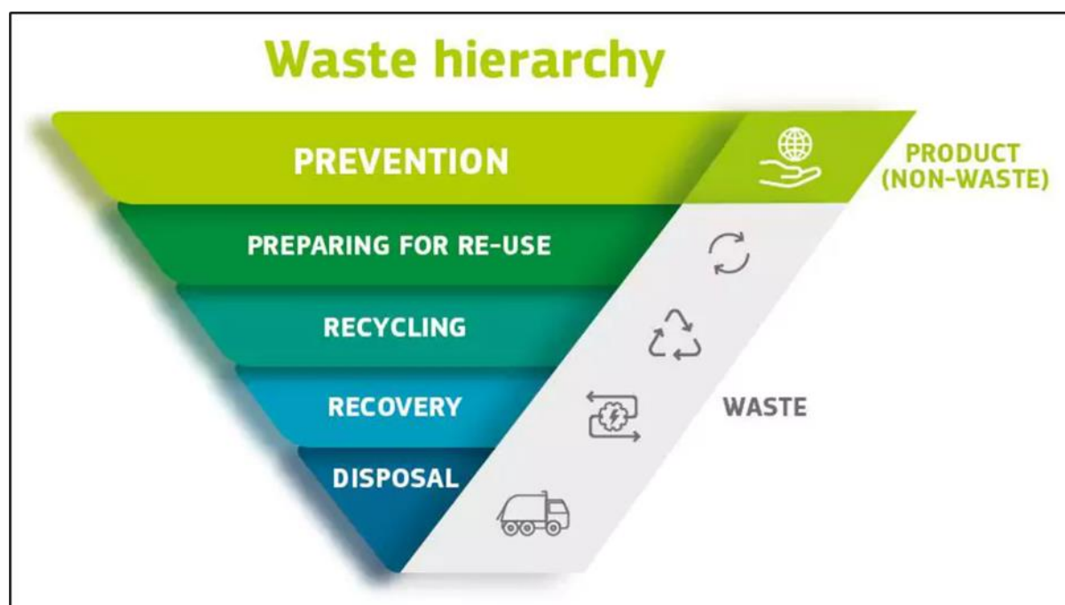
Figure 8-1 Waste Hierarchy