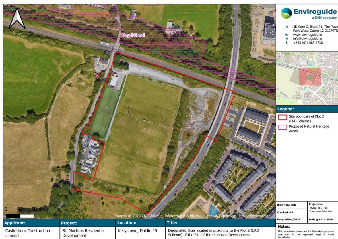
Figure 3-2 St Mochtas Site Plot 2 Site Location

The Site location for Plot 2 is shown in Figure 3-2.