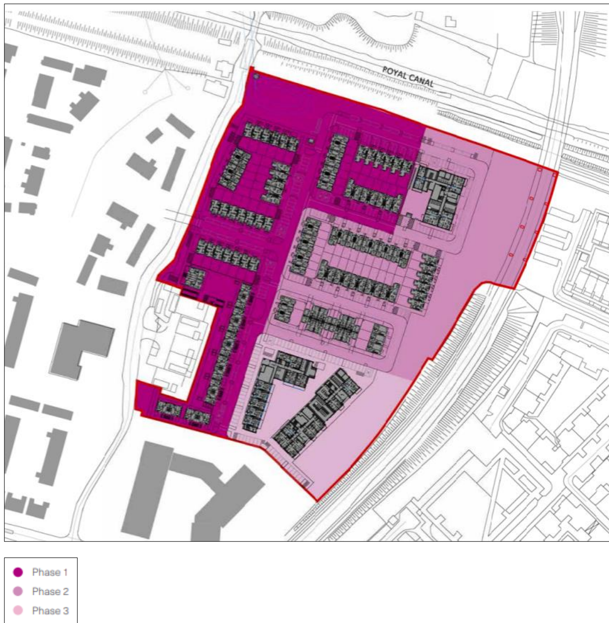
Figure 4-1 Proposed Construction Phasing for St Mochtas LRD Plot 2 (O'Mahony Pike, Design Statement, 2025)

Note that the programme will be updated in the register of live documents appended to the CEMP and agreed with the assigned contractor as the works advance, or if there is a change in the scope for the construction phase of the development.