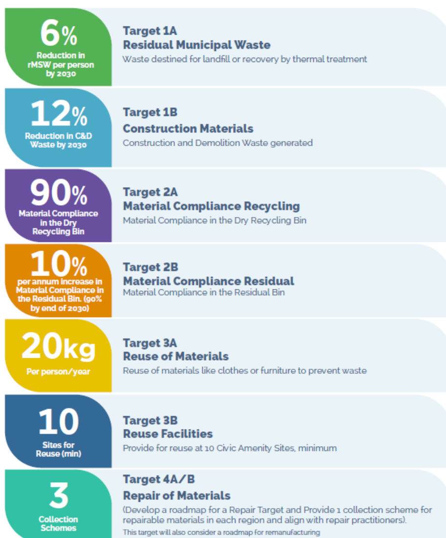
Figure 2-1 National Targets for Waste Prevention and Reduction 2024-2030

Eight national Targets have been developed as shown in Figure 1 below: