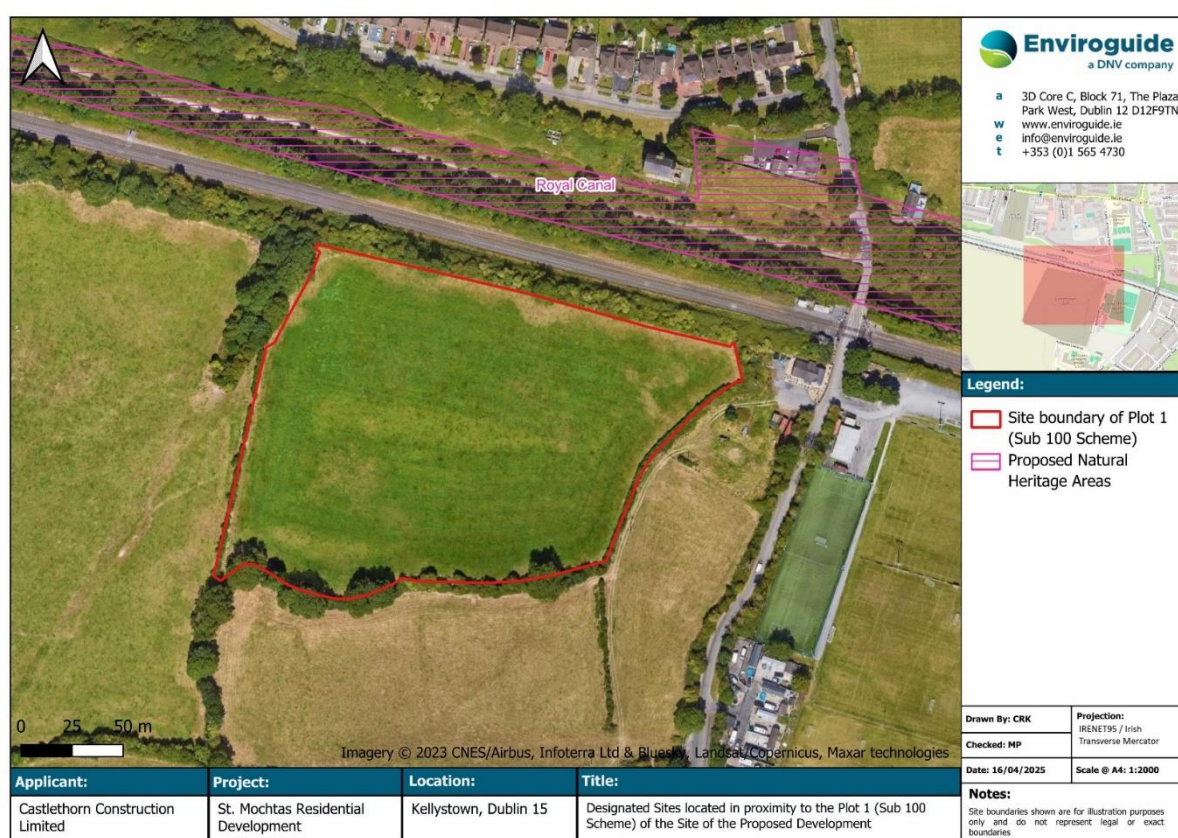
Figure 3-1 Luttrellstown Gate Plot 1 Site Location

The application site is currently a greenfield site. It is located in the Kellystown LAP, north of the new Kellystown Link Road under construction, west of the Porterstown Road and north of Luttrellstown Road. The site location for Plot 1 is shown in Figure 3-1.